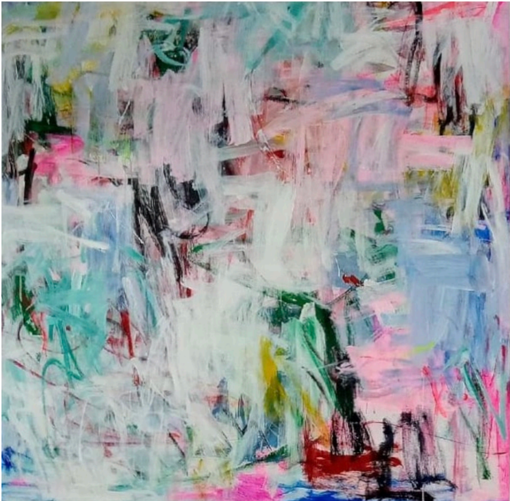
012. Untitled, 2022 by Miljan Suknovic