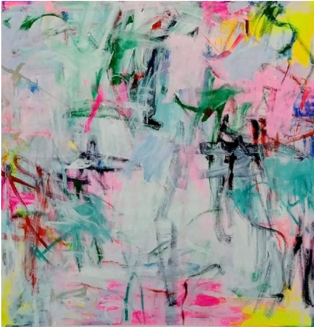
011. Untitled, 2022 by Miljan Suknovic