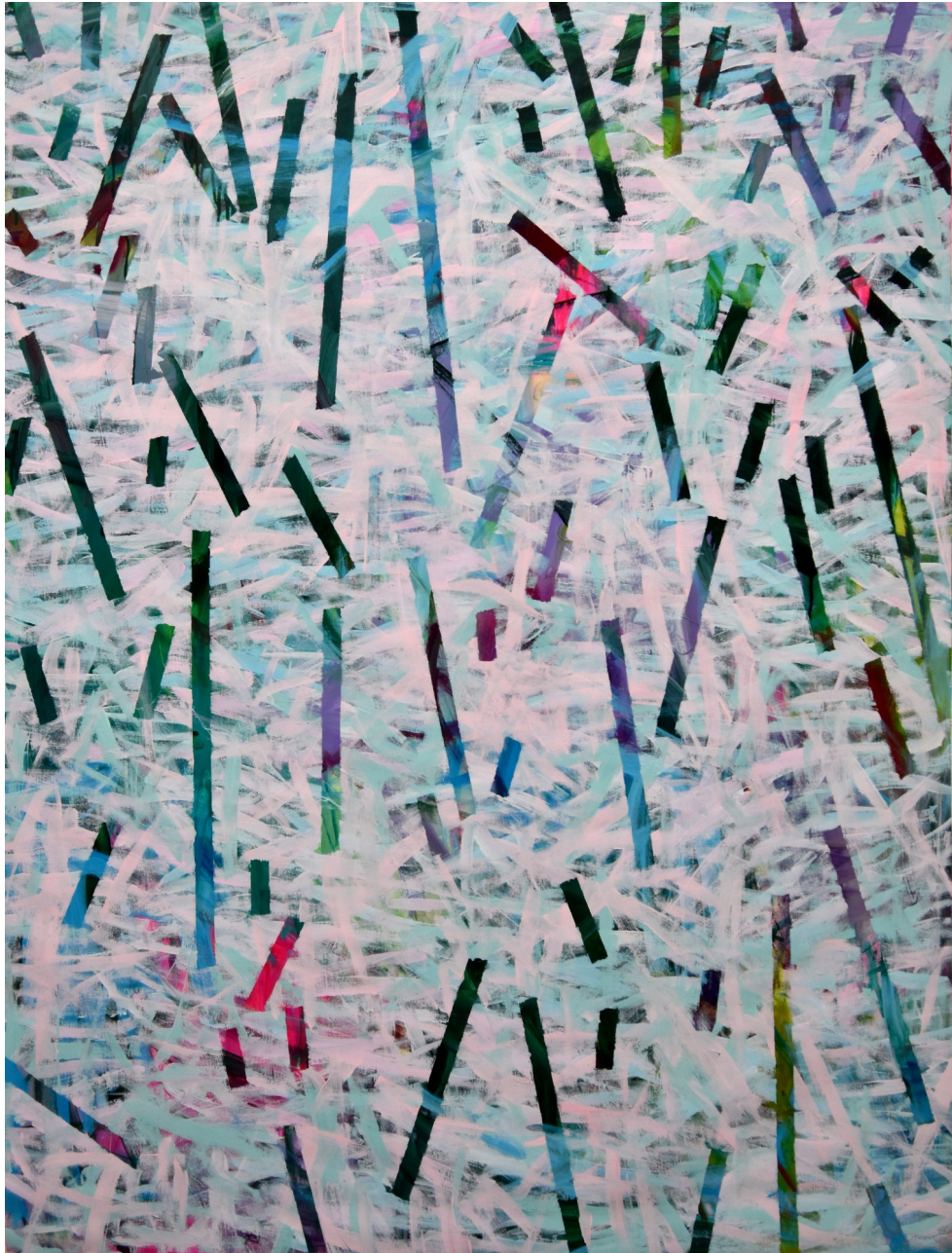
008. Untitled, 2024 by Miljan Suknovic Acrylic on Canvas 66"x 44"/ 168cm x 112cm