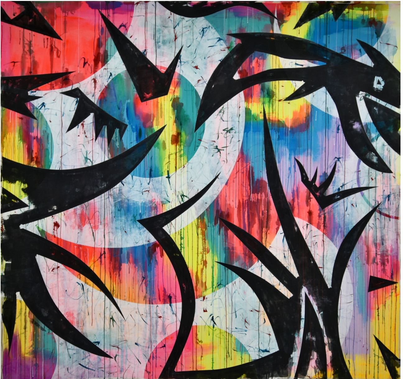
001. Untitled, 2023 by Miljan Suknovic Acrylic on Canvas 120"x 120"/ 305cm x 305cm