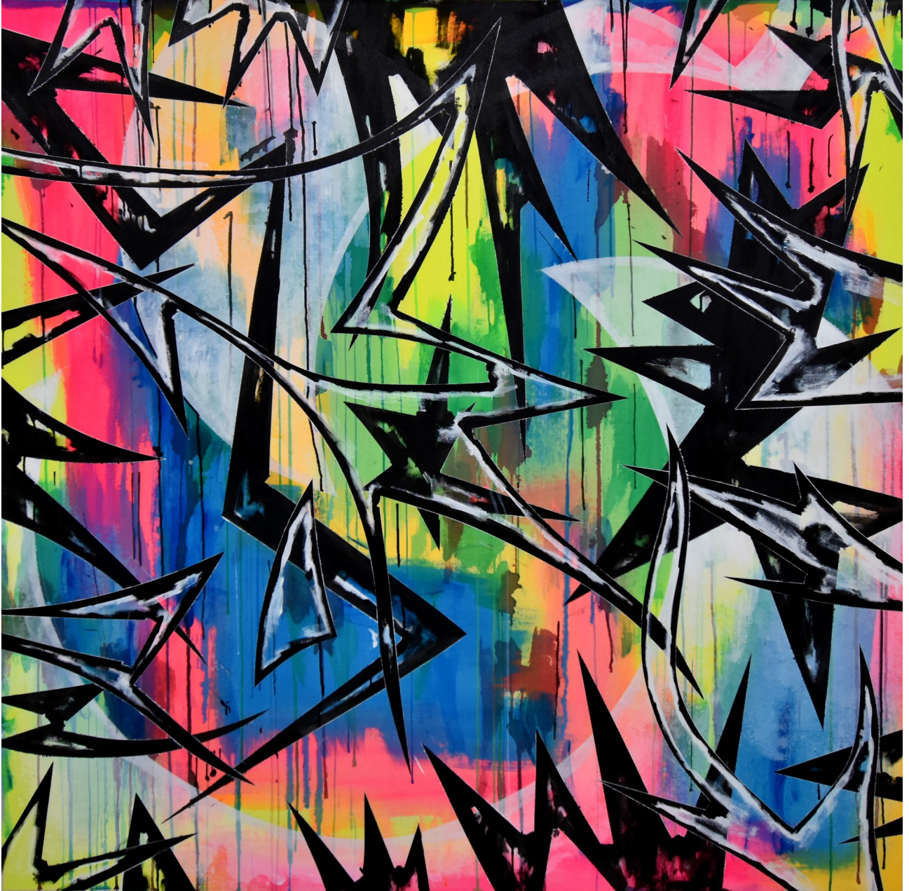
003. Untitled, 2024 by Miljan Suknovic Acrylic on Canvas 57"x 57"/ 145cm x 145cm