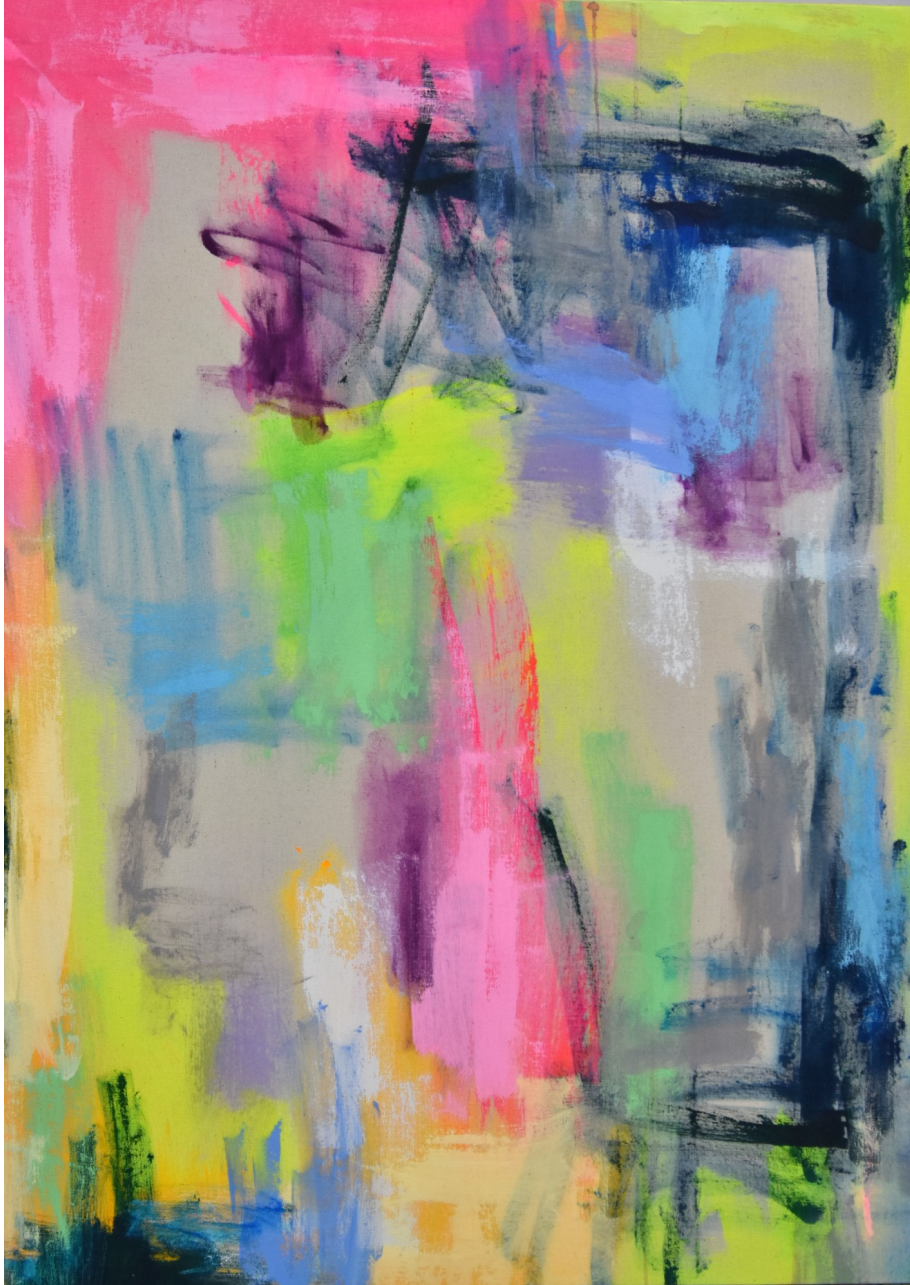
009. Untitled, 2024 by Miljan Suknovic Acrylic on Canvas 36"x 27"/ 91cm x 69cm