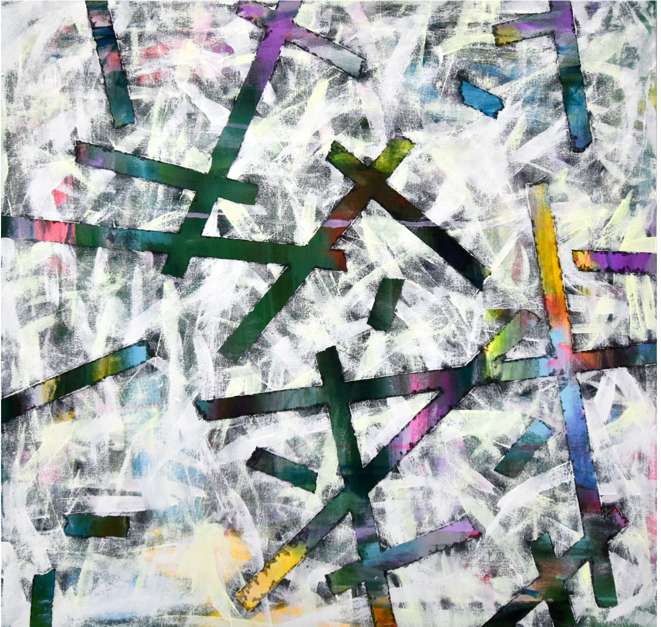
007. Untitled, 2024 by Miljan Suknovic