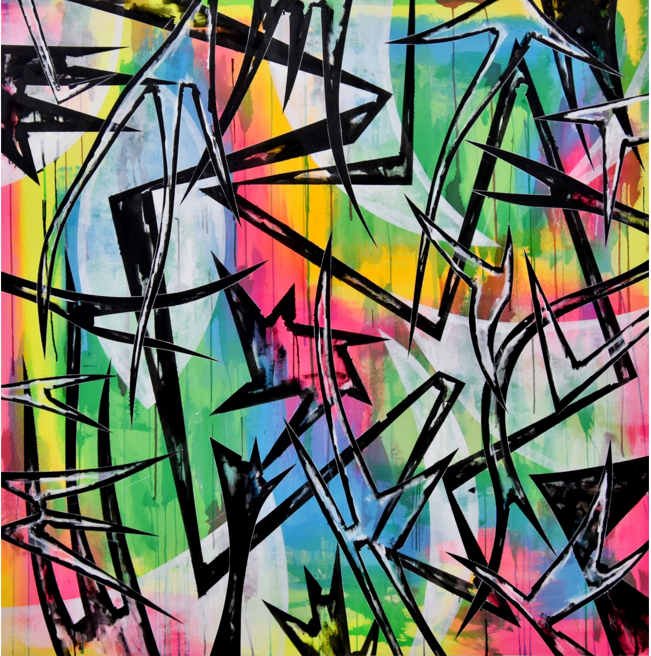
002. Untitled, 2024 by Miljan Suknovic Acrylic on Canvas 57"x 57"/ 145cm x 145cm